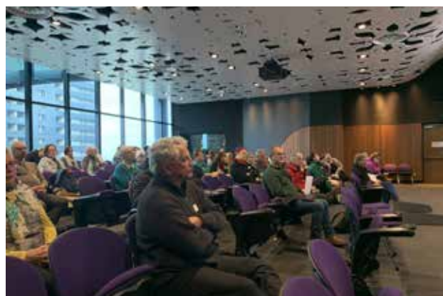
Peter MacCallum Cancer Centre

We had a great turn out on a very wet, cold Melbourne morning by patients, carers and health professionals to hear presentations on late effects & survivorship, sleep management, fatigue management and sexuality and intimacy. Thank you to those of you who came along